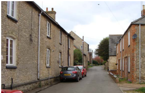
Stone and brick built cottages in East Street

These are interspersed with some less appropriately designed larger modern detached dwellings that have been built from the late 1990's onwards. These properties are not in keeping with their surroundings.