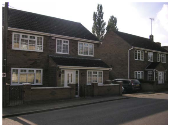
More modern brick built houses in Church Street