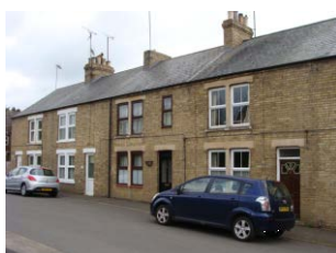
Victorian terraced cottages