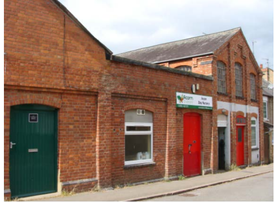
Commercial properties at Bland's Yard

Next to Bland's Yard is a stone and rendered cottage that was formerly 3 cottages that have now been combined. Beyond here are several stone built cottages including Crown Cottage which is former public house. There are also two brick built detached houses built in the 1970's which are slightly out of place.