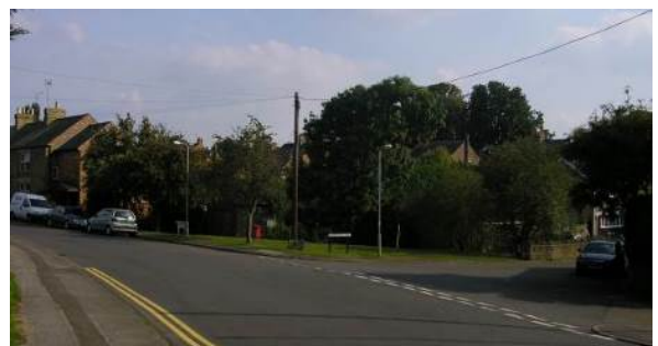
Open space at the junction of The Avenue with Newbridge Lane and Church St.