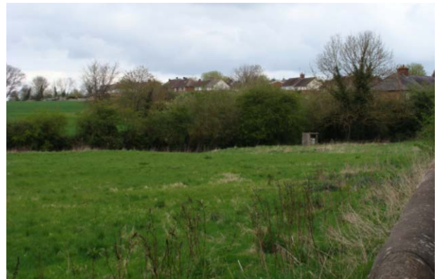
Open fields from West Street

West Street is the principal road into Stanwick from the A45. With its open fields as it enters the village from the A45 roundabout, it gives an important rural aspect to the entrance of the village.