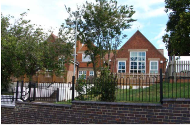
Stanwick School from Church Street

Opposite the school, which was built in 1899 and sits well back from the road on a high bank, is Bland's Yard. This is a former shoe factory which has now been separated into smaller commercial units. The main building is thought to date back to 1890 and behind are other small units built at various times since then. All of the businesses in Bland's Yard are small and often owned by Stanwick residents. This area is important from an industrial heritage point of view and also for the economy of Stanwick as it provides valuable employment and reduces commuting. Acorn Nursery is also found here which provides valuable child care services.