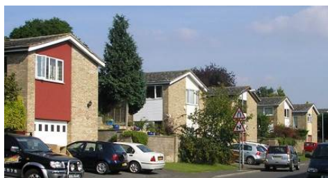
1970's bungalows with garages below in The Avenue

The Avenue has mixture of housing types; Victorian terraced brick built cottages, early 1980's detached houses, 1970's bungalows with garages below. The Avenue also has a pleasant open space at its junction with Newbridge Lane and Church St. The larger detached houses are set well back from the road and screened by tall hedging.