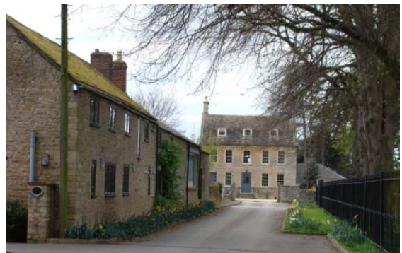
View towards Stanwick Hall

Off Higham Road is Dovehouse Close which is a tree lined lane that has two Grade II listed buildings; Dovehouse and the Georgian Stanwick Hall. Both are stone built and are very imposing houses. There are also stone buildings that are in part converted from former farm buildings.