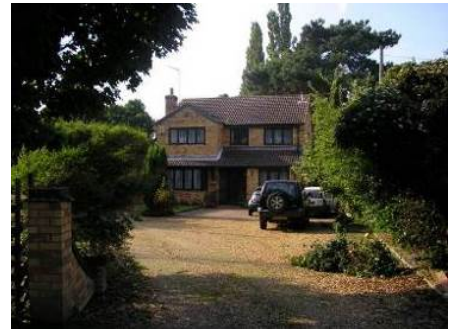
Modern houses at The Hollow

development of larger modern detached houses that are out of character, though they are not particularly visible from the road.