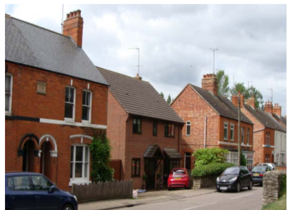
Single modern house between Victorian cottages in Spencer Parade