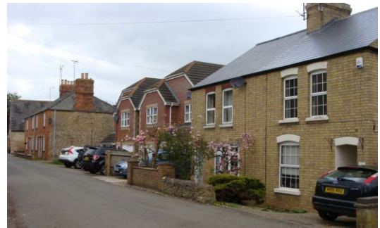
Modern detached houses between Victorian cottages